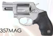
Taurus 905SS2 .357MAG