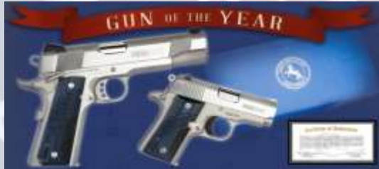
Gun of the Year – Colt NRA Matched Set XSE Government .45ACP & Mustang Pocketlite .380